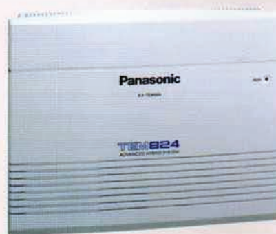
KX-TEM824 6 CO lines / 16 Extensions (Max. 8 CO lines / 24 Extensions)