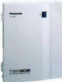
KX-TEA308 3 CO lines / 8 Extensions

Panasonic's analogue telephone system has taken telephone systems for small to mid-sized companies a giant leap forward, offering features seldom available in this category. Its easy upgradability reduces the cost of expansion, Caller ID increases your efficiency, and voice-processing integration improves productivity.