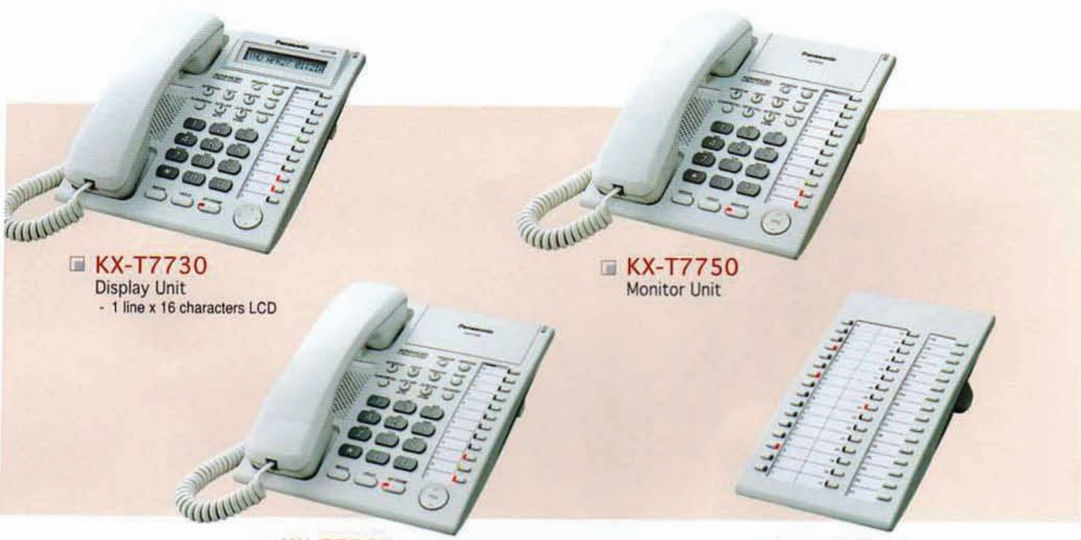
KX-T7730 Display Unit - 1 line x 16 characters LCD