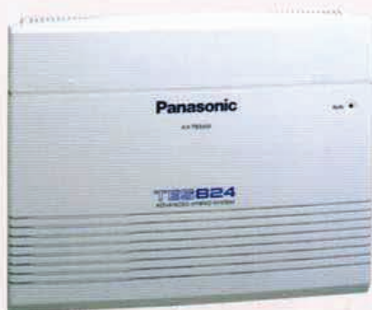
KX-TES824 3 CO lines / 8 Extensions (Max. 8 CO lines / 24 Extensions)